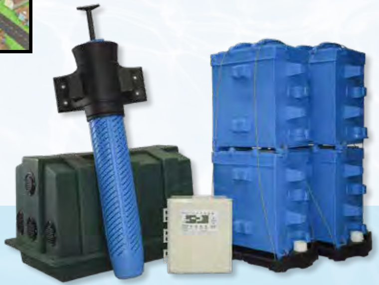
Pictured: HSMBR® membrane modules, control panel, blower housing, SaniTEE®